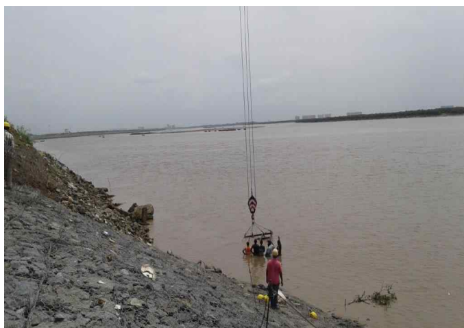
Fig 5. Highly skilled diver's placing PP rope gabion.

Factor # 2 was the flexible nature of the polymer gabion boxes that could stabilize very easily on a highly uneven surface, thus proving that the choice of this material for apron construction was appropriate.