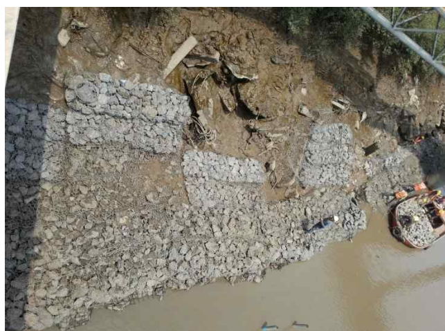
Fig 6. Concrete debris incorporated into structure

The second challenge that was faced was that the concrete debris material that was dumped as a part of temporary bank protection, posed a challenge for installing the designed scheme. This challenge was overcome by: