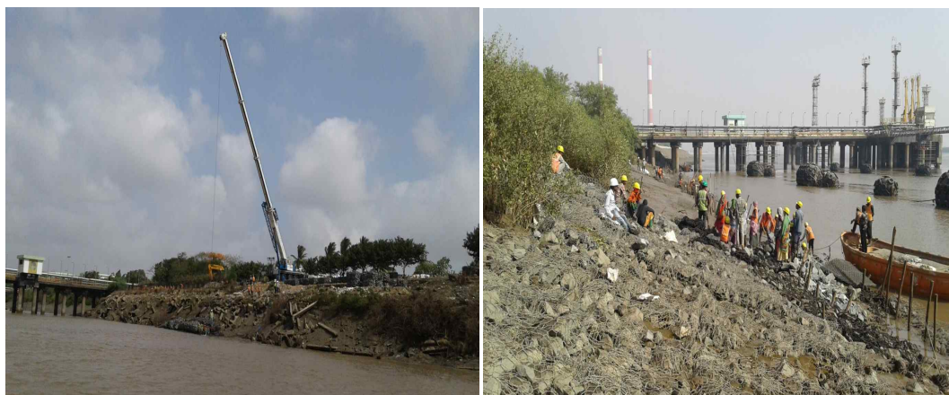
Fig 4. Installation of gabions under water using a hydra and boats.

4. Placing of Gabion Units. The required numbers of assembled gabion units were placed side by side in the required position. The adjacent units were joined together by lacing using the single and double loop technique.