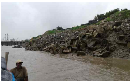
Fig 2. Temporary bank protection measures taken up by RIL.

Options # 1 & 2 were “soft” options while Option # 3 was a traditional hard option.