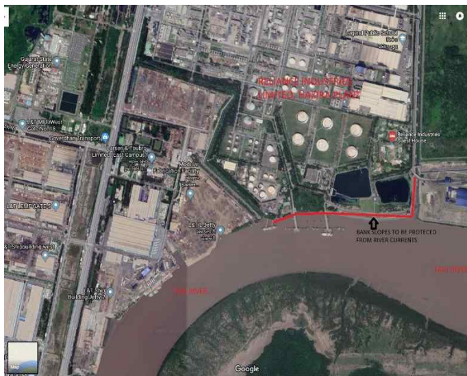
Fig 1. Google map picture showing the plan view of the RIL Hazira facility and location

Over the course of the years, temporary protection work in the form of dumping of concrete (Figure 2) and other debris on the bank, had been taken up by the Reliance Engineering team. Although these measures had served to provide temporary protection to the facility, a permanent protection measure was needed. In order for the captive power plant to be constructed, it was necessary to protect the facility from the ravages of the meandering river Tapi. The risk of a breach in the bank endangering the captive power plant was too large to be ignored. The typical morphology of the site also meant that traditional solutions would not work.