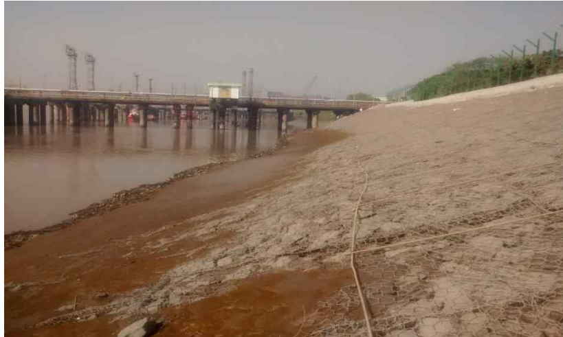
Figure 8. Completed structure showing the siltation over the revetment and apron.

The project was completed successfully in March 2017, exactly 12 months after award of the work. The completed structure is shown here.