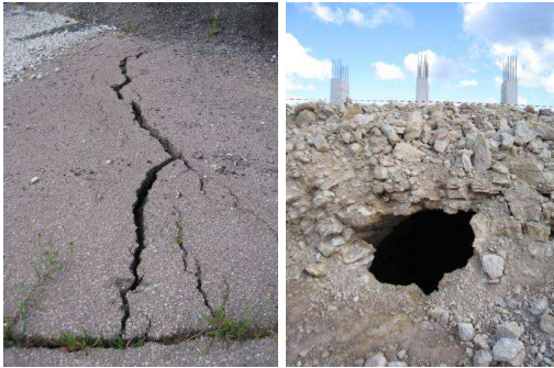
Figure 3. Cracks due to sinkhole and sinkhole on the site

The Kukruse - Jõhvi section was a traditional mining exploitation area until the 1960's. Knowing this potential risk a complete geotechnical study was carried out including geological radar and boreholes. The galleries discovered are located 3m to 14m under the ground level, their height vary from 1,6 to 3,5m and they can be 2m to 90m wide. Some of them are reinforced with piles to prevent them from collapsing but it still represents a dangerous area for the motorway project. In fact, some sinkholes are regularly discovered in this region.