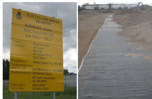
Figure 1. Building site sign and geogrid installation

This section represents approximately 330 000 m 2 of a very high tensile strength reinforcing geogrid. This is an exceptional building site for this quantity and this level of reinforcement: 1350 kN/m in machine direction. The building site should be finished in beginning of 2010 for the geogrid part.