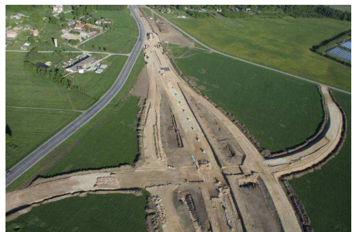
Figure 6. Aerial view of the building site.

Some precise information to organize the building site was proposed to the building company based on the document of the French Committee of Geotextiles and Geomembranes called: recommendations for the use of geotextiles in reinforced soil constructions.