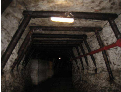
Figure 2. Oil shale mine similar type under the building site.

In Estonia, an important activity is based on mining and processing of oil shale. Estonian soil has got resources in this potential raw material for energy production.