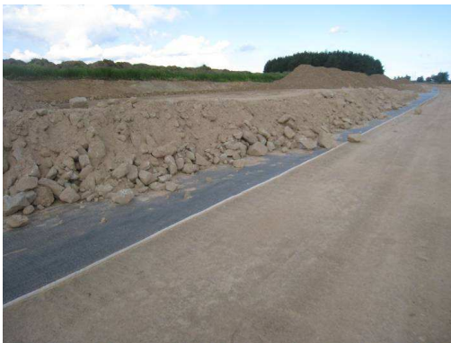
Figure 8. Geogrid starting to be covered.

This exciting building site has no equivalent today in terms of tensile resistance, surface and delivery conditions.