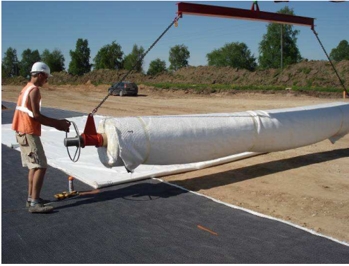
Figure 7. Installation of the geogrid.

This exciting building site has no equivalent today in terms of tensile resistance, surface and delivery conditions.